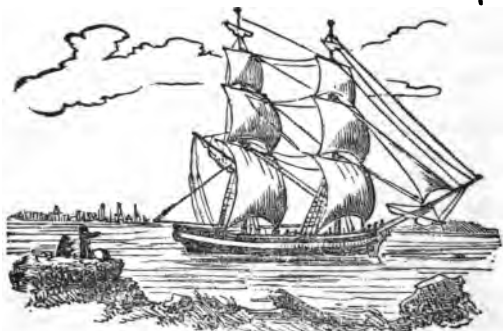
Arrival of the brig Lydia at Boston.